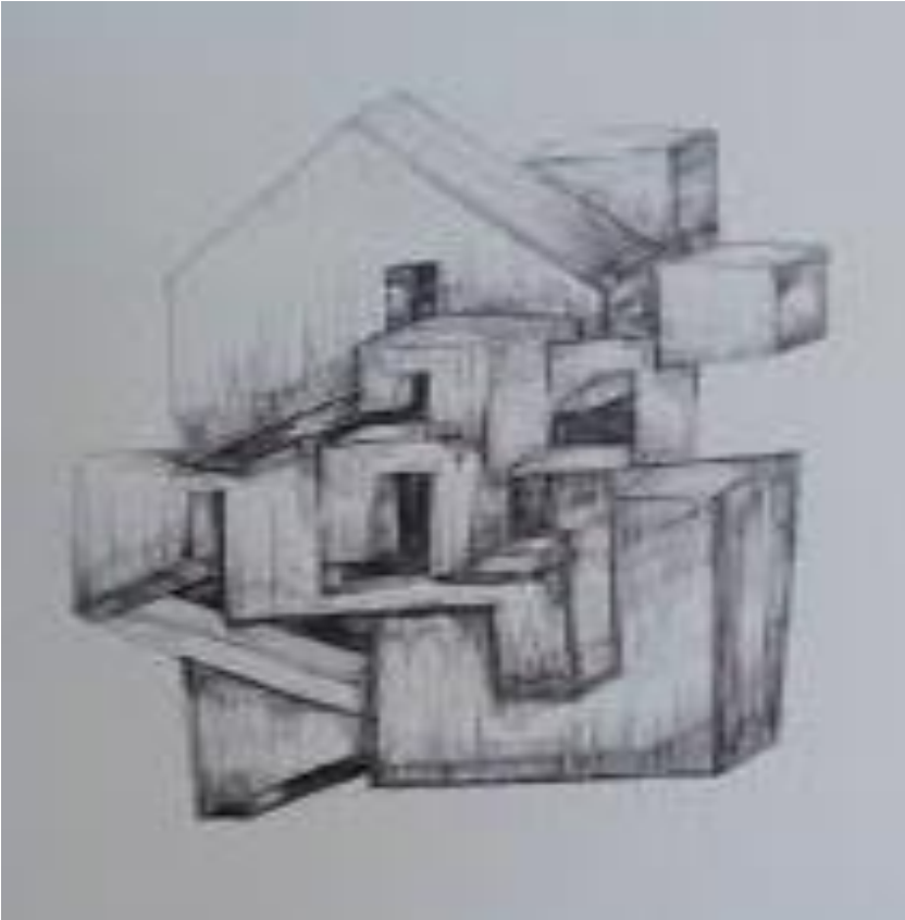
Cubist house design inspired by Birmingham Library- AGajdaArt