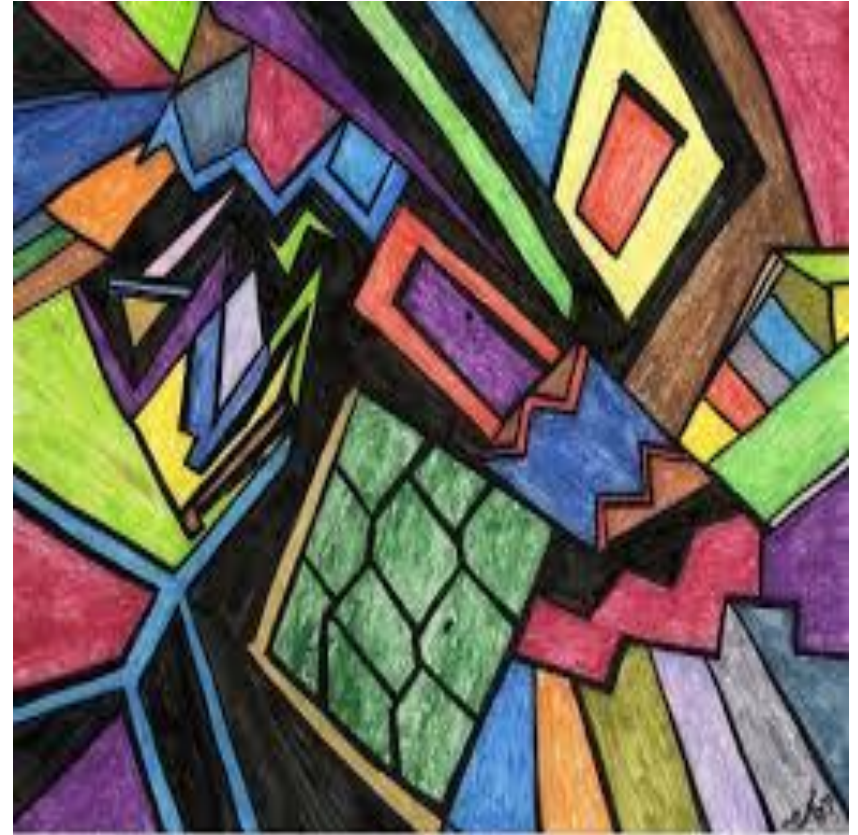
Abstract House with Garage- NinaDomenico